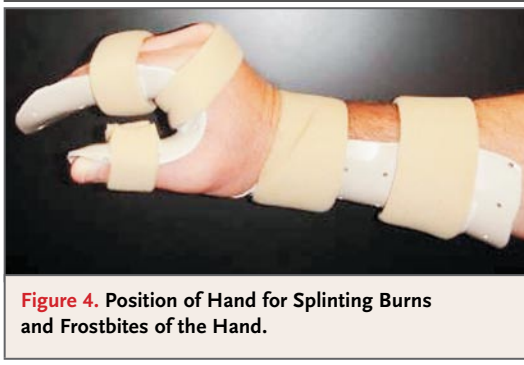
Figure 4. Position of Hand for Splinting Burns and Frostbites of the Hand.

particles. 62 The important exception to the treatment of a chemical burn with water lavage involves injury from the elemental metals (i.e., lithium, sodium, magnesium, and potassium), which spontaneously ignite with water. Exposure to hydrofluoric acid, which is used in etching and rust removal, leads to intense pain and tissue damage. 62,63 Treatment includes copious irrigation followed by the application of calcium gluconate gel or subcutaneous injection of calcium gluconate, with the goal of relieving the pain. A burn from hydrofluoric acid that involves more than 5% of total body-surface area, or more than 1% of total body-surface area if the concentration of hydrofluoric acid is greater than 50%, requires