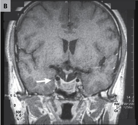
Figure 1. MRI Scans Showing Tumor Shrinkage after Treatment with a Dopamine Agonist in a Patient with a Macroprolactinoma.

Gadolinium-enhanced MRI scans obtained before dopamine agonist therapy, showing a large pituitary mass (Panel A, arrow) and after 1 year of treatment, with marked reduction of the mass (Panel B, arrow).