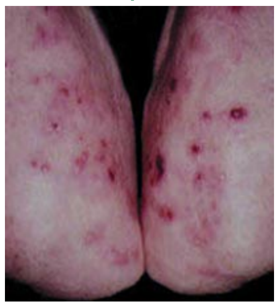
FIGURE 2. Dermatitis herpetiformis, which is characterized by symmetric pruritic papulovesicles and excoriations, is found exclusively in people with celiac disease.